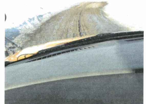
Peerless Route 162 miles daily