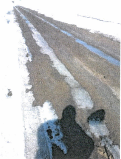
West of Whitetail