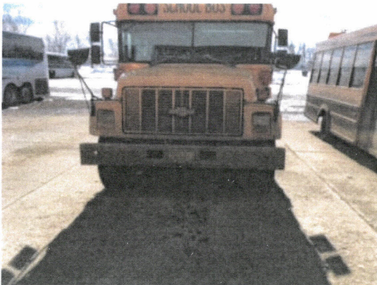
Life expectancy Daniels Co 5-7 years as compared to 10 years