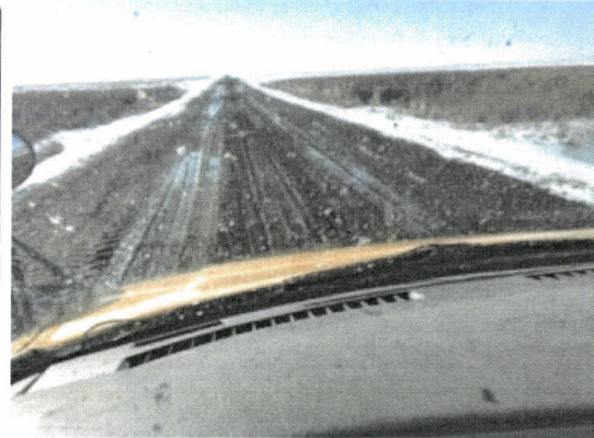
West of Whitetail 112 miles daily