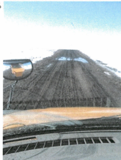
West of Whitetail