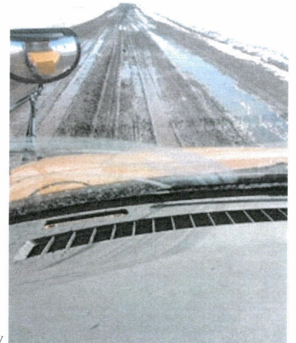
West of Whitetail