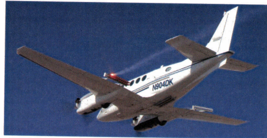
MODIFIED AIRCRAFT FOR CLOUD SEEDING.

Montana state laws regulating weather modification date to 1967 with the passage of the Weather Modification and Control Act. Soon after the passage of the act, Montana State University researchers launched an "experimental winter orographic cloud seeding program" in the Bridger Range. 3 The project was part of the U.S. Bureau of Reclamation's Project Skywater, which tested the technology in Western drainages “to explore, develop and determine the feasibility of applying the technology of weather modification to meet the nation’s increasing demand for clean water.” 4