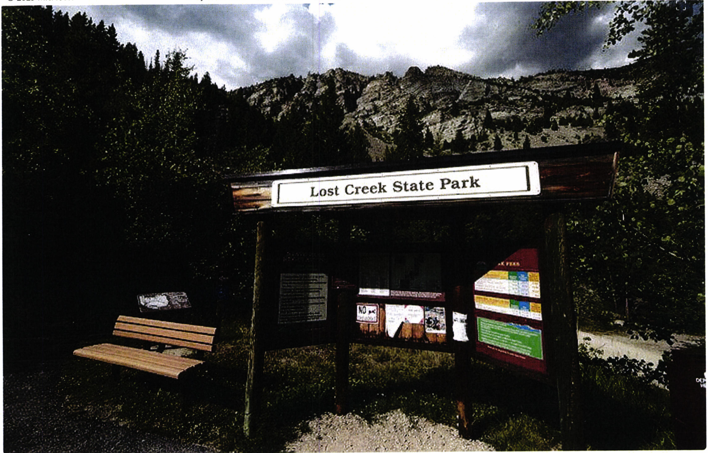
Lost Creek State Park

Between the pink and white granite formations and the gray limestone cliffs of this area lies a canyon about 1,200 feet below.