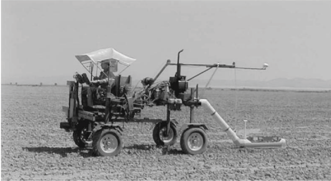
Figure 3. Mobile dual-dipole electromagnetic induction equipment for the continuous measurement of apparent soil electrical conductivity (Corwin and Lesch, 2003).

package, ESAP-95, to select optimal sites for calibration of the relationship between the apparent soil electrical conductivity measured with EMI and the EC of the soil water at different depths measured in the laboratory (Lesch et al., 2000). The soil samples can be easily taken with a soil coring device in the back of a 1-ton pickup with a 2-inch diameter device that can go down 4 to 6 feet or deeper if soil conditions permit. The theoretical background of ESAP-95 is presented by Lesch and his colleagues (Lesch et al., 1995a; Lesch et al., 1995b). Several applications of this software have been reported in the scientific literature (Amezketta, 2007; Amezketta and Lersundi, 2008; Corwin and Lesch, 2003; Corwin et al., 2006) as well as by consulting companies 7 .