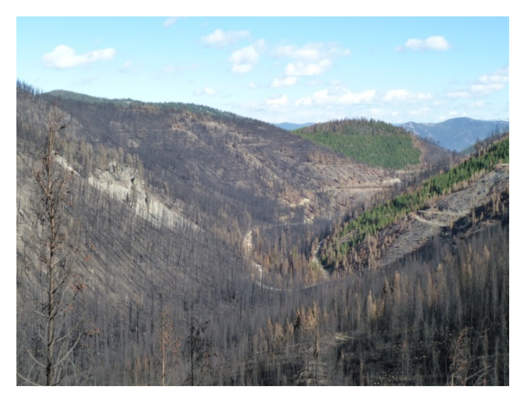
Figure 2. View of Woods Creek drainage following the Saddle Fire located more than 10 stream miles from Painted Rocks Reservoir (photo taken 10-14-11).