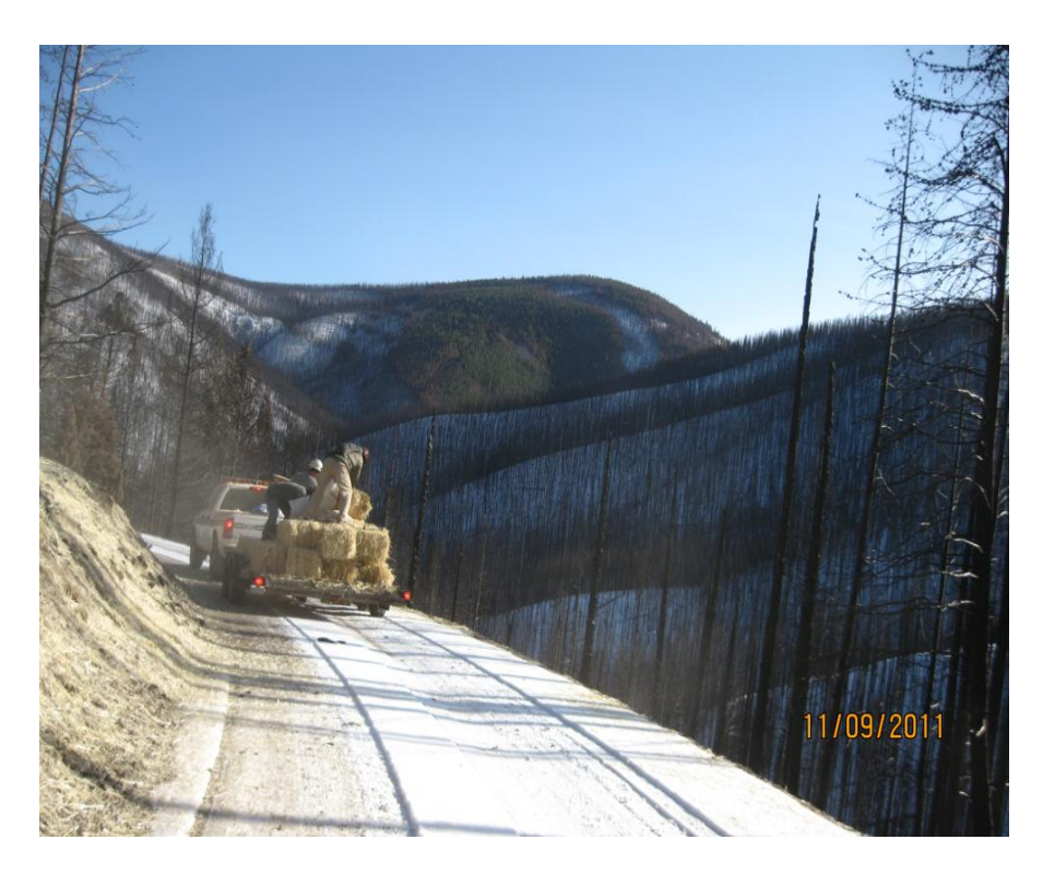
Figure 4. Straw mulch and seed being applied to stabilize roads within the burned areas.