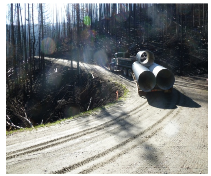
Figure 3. Large culverts being installed within areas burned by the Saddle Fire to protect Beaver Creek Road (Forest road 91) from washing out (photo taken 10-14-11).