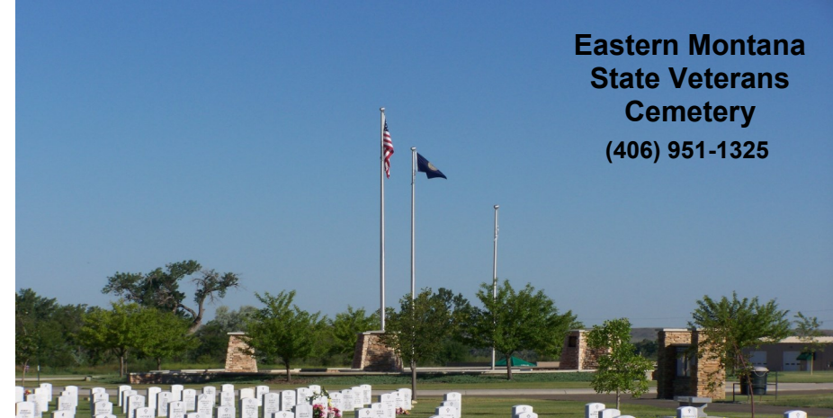
Eastern Montana State Veterans Cemetery