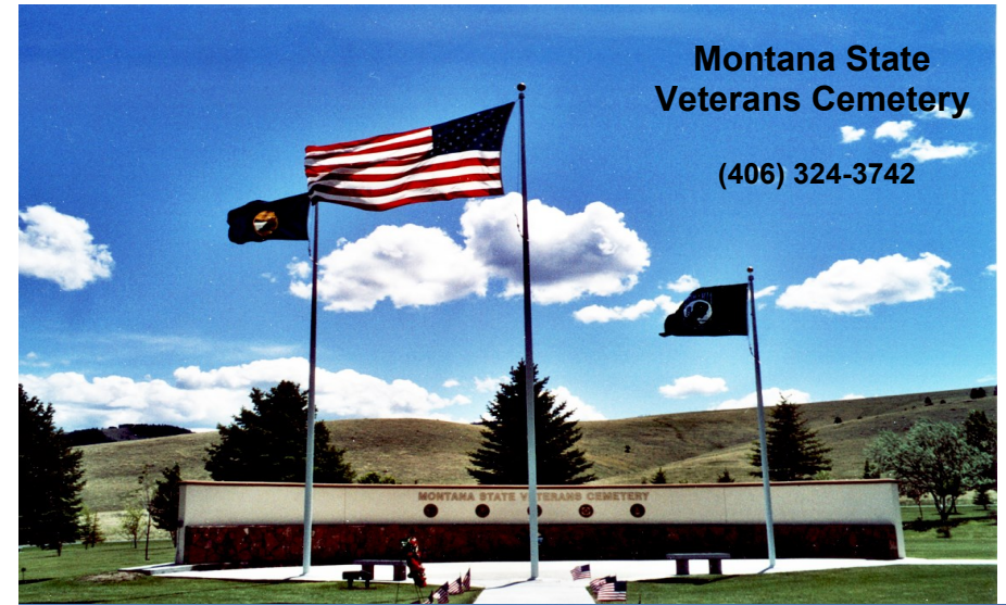
Montana State Veterans Cemetery

The headstone is furnished by the government as a benefit to the veteran/spouse, at no cost. However, the family will be responsible for the $115.00 setting fee cost. The Cemetery Sexton will complete the headstone application.