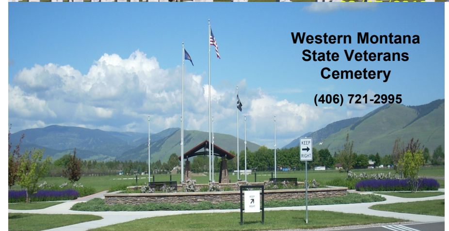
Western Montana State Veterans Cemetery