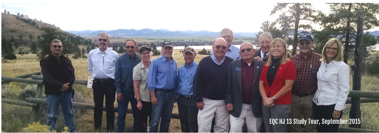
EQC HJ 13 Study Tour, September 2015