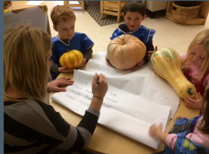
Sink or float predictions, Early Childhood Center Flathead Community College, Kalispell