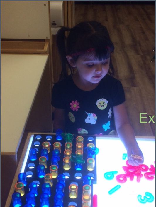
Explorers Academy, Billings Head Stars