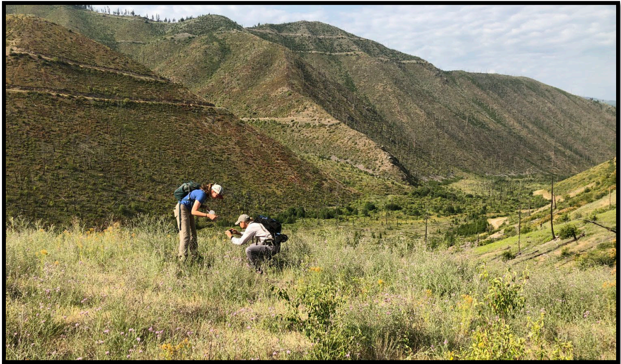
Figure 3. FWP wildlife biologist, Liz Bradley and a Missoula County Youth Weed Crew member releasing spotted knapweed seedhead weevils, Larinus minutus , in the Fish & Nemote Creeks WHIP project. Biological control agents along with herbicide and reseeding are all included in the weed treatment plan for this project.