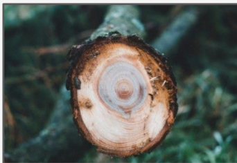
Stakeholder Engagement, Outreach, and Education