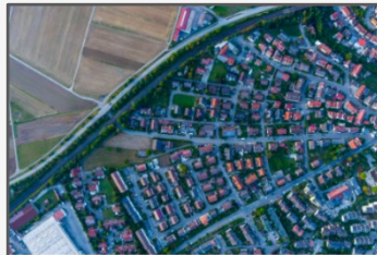
Water Right Application Processes