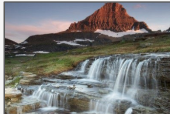
Changes, Mitigation, and Exceptions