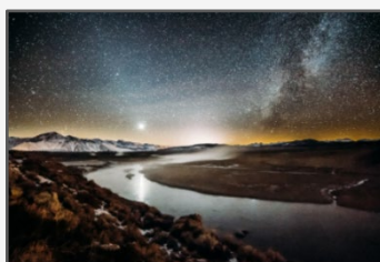
Water Rights Query System