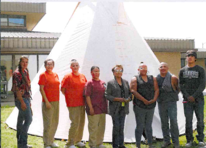
Members of the Crow tribe recently donated materials and helped inmates at Montana Women's Prison to set up a tipi on prison grounds. It will be used for smudging and other activities.