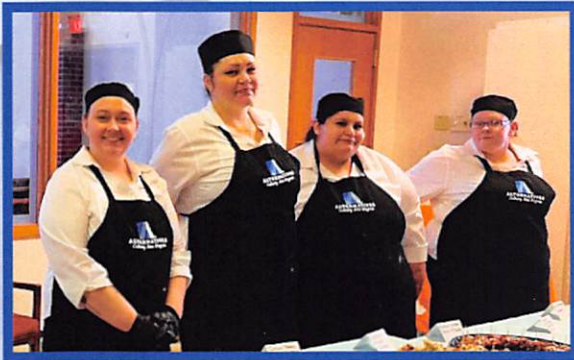
Culinary Arts Program participants catering an event for a local nonprofit organization