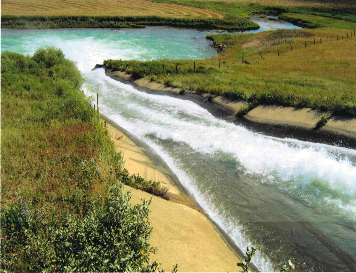
A 2014 photograph of the Drop 5 structure